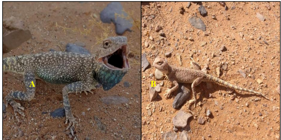
Fig. 3. Trapelus boehmei in natural habitat. a: Close-up view (Snout-vent length), b: General view.