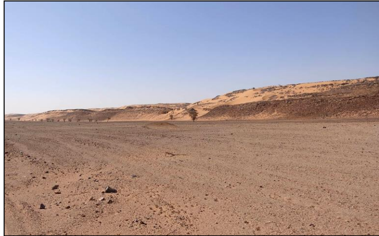
Fig. 2. General view of the study area, Hassi Mounir, Tindouf.